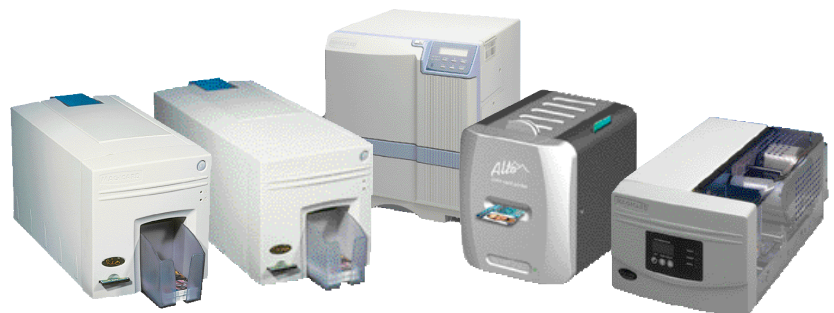
Magicard Professional Color ID Card Printers

Ultra Electronics Card Systems Waverley House, Hampshire Road, Granby Estate Weymouth, Dorset DT4 9XD, United Kingdom Tel: +44 (0) 1305 784738 Fax: +44 (0) 1305 777904 email: UKsales@UltraMagicard.com